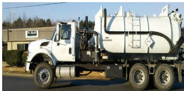
High Capacity Vacuum Truck

W. L. Black and Associates utilizes Recycle and Re-use Technologies for fluorescent lamps, as well as other Universal Waste Streams.